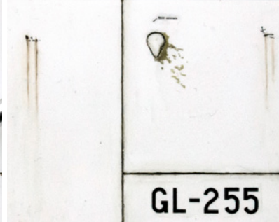
This method works fast and easy to use with a perfect result.