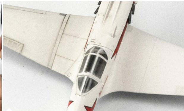
When the excess paint is removed your panel lines will look the part! Easy and straight forward.