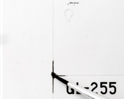
After shaking up the paint, apply on your model straight from the jar.