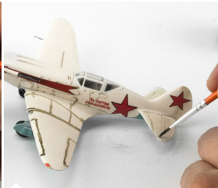
This product allows you to work fast. Apply the Paneliner in one section and while drying you can continue to apply it in another section of your model.