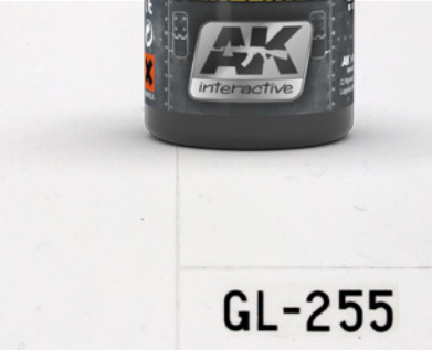
Accentuating panel lines really brings an aircraft model to life.

Many modellers struggle as they have to choose the right color to accentuate the panel lines of an aircraft. We did the research for you and offer you the right color for each scheme, even for difficult tasks like white and winter camouflage.