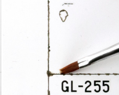
After 5 till 10 minutes clean the excess paint off with a brush moistened with White Spirit.